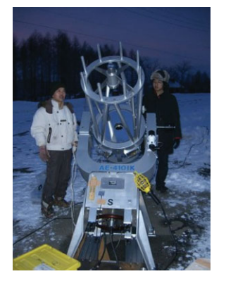
Figure 2. 40 cm infrared telescope at Rikubetsu, the coldest place in Japan